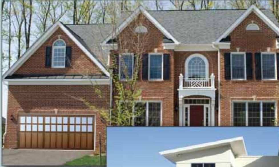
Above: Residential Carriage House

If you want the look of wood, but not the maintenance, then Arm-R-Lite has the perfect answer. A new technology from Italy has made it possible for Arm-R-Lite to coat any of our custom made aluminum doors with a maintenance free faux wood finish. This finish will not fade in sunlight and is warranted to be free from defects for a period of 10 years. Available finishes include Cherry Flame, Dark Walnut, Medium Oak, Light Oak, Douglas Fir, and Acacia Wood.