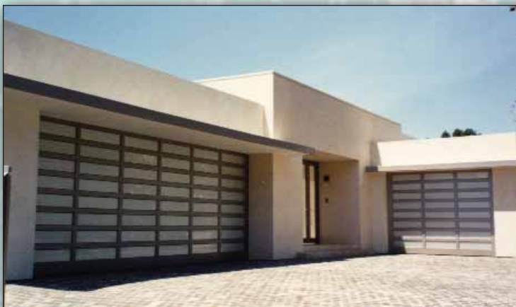
Private Residence, Beverly Hills, CA