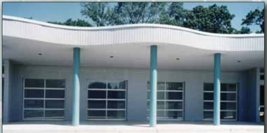
Camp Blue Sky, Long Island, New York