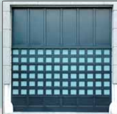
Private Residence Installed by Advanced Door Sales, Franklin, NJ