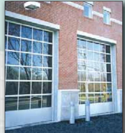
Milford Fire Dept., Milford, MA Installed by Door Systems, Framingham, MA