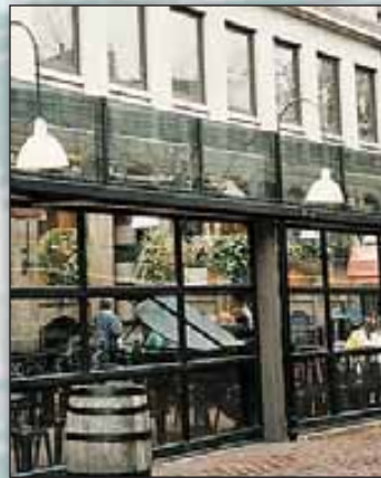
Quincy Marketplace at Faneuil Hall, Boston, MA