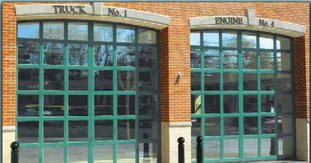
Arm-R-Lite Aluminarc Model

U.S. Patent No. D498303, Installed by Edison Overhead Door, Edison Fire Department, N.J.