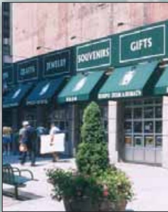
International Pavilion, 5th Ave., NY,NY Installed by Reggio Garage Door

Fire Department Installations in 40 states.