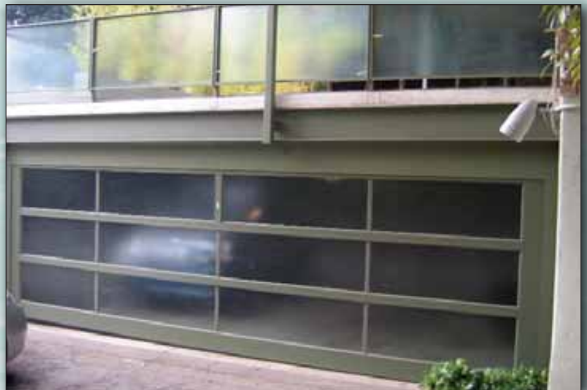
Private Residence, California