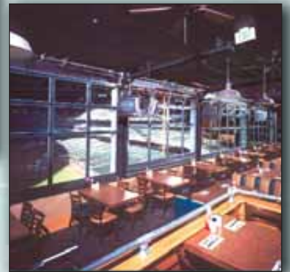
Chase Field, Arizona Diamondbacks Stadium, Phoenix, AZ