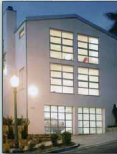
Private Residence, California

SIDE WEATHER SEAL: Wood jambs—positive seal aluminum stops. Steel jambs—vinyl perimeter seal.