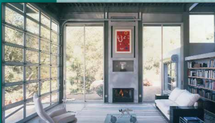
Private Residence of Barton Myers, Architect